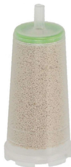
Nical 50 25L 3010303

This water softener needs to be rinsed before use.