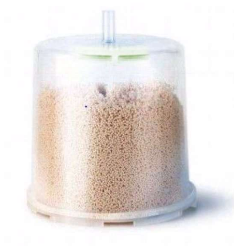
Nical 300 300L 3010410