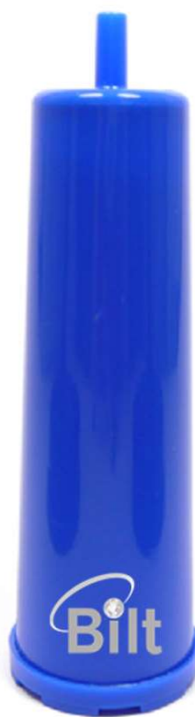
Nical 900 150L 3010231