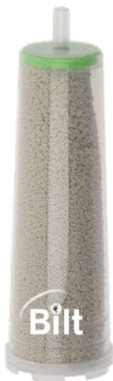
Nical 250 50L