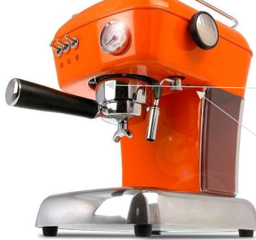
Fig.1 Remove 2 long screws