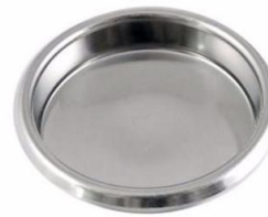
Steel blind filter

How often should I backflush? Commercial machines : Daily Home machines : At least once a week