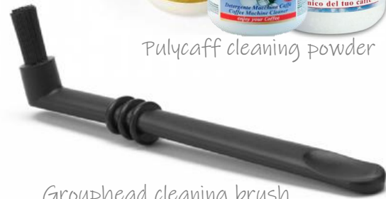
Grouphead cleaning brush