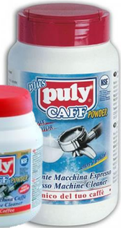
Pulycaff cleaning powder